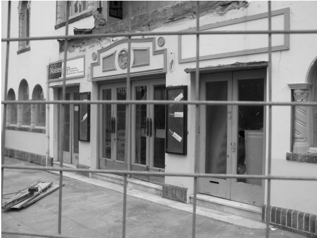
11-Sep-10: Canterbury Repertory Theatre – Behind bars but in good heart. Rubble has now been removed, saving parts that might be of use in the rebuild. Not a broken window with exception to someone attempting to break in overnight!

Auditions Saturday 16th and Sunday 17th October 2010 — Email canterburyrepertory@xtra.co.nz